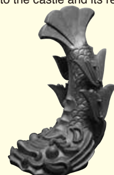
New shachihoko roof decoration for the subsidiary tower of the keep